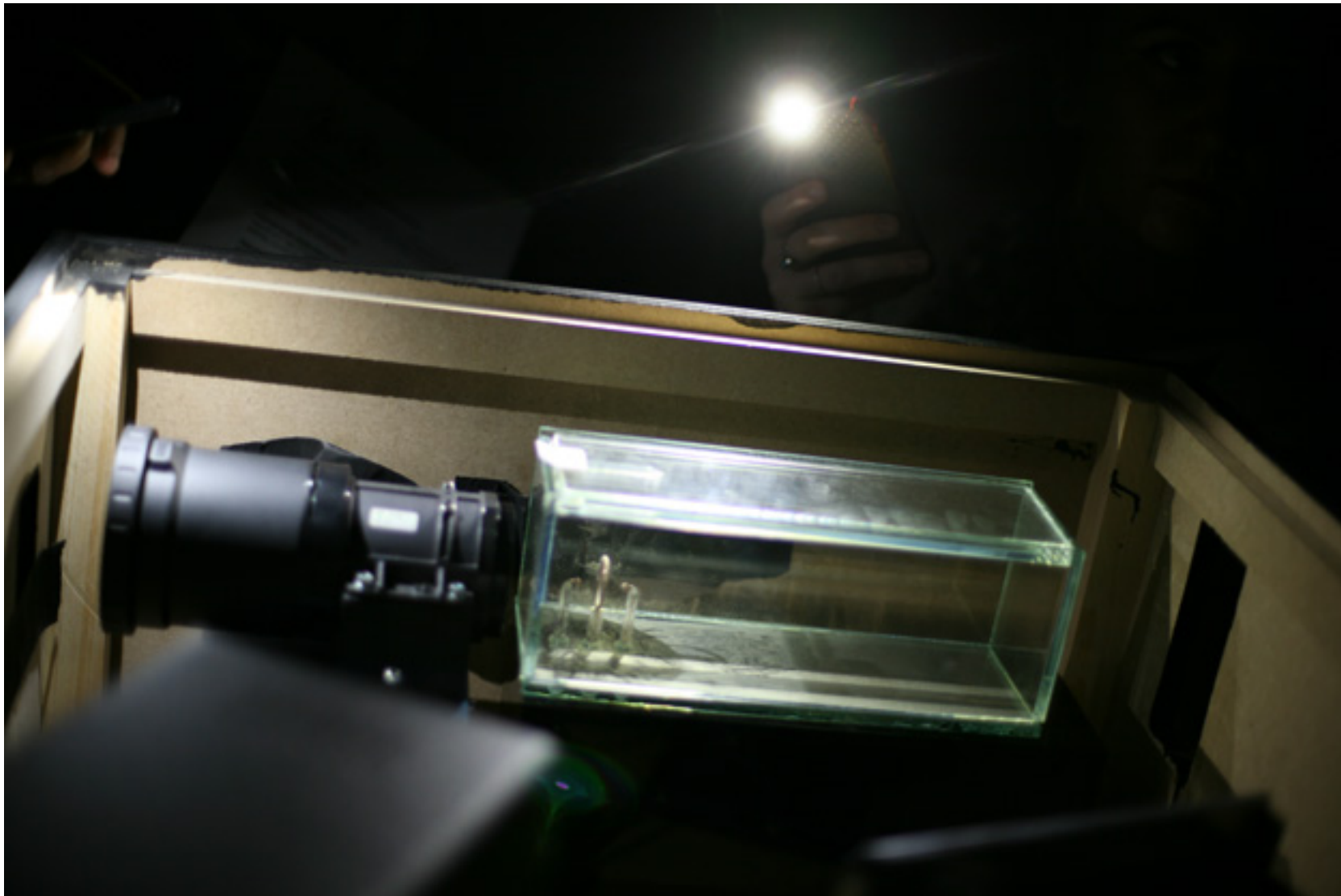
Close up of the Paul trap in its glass chamber (27 x 10 x 10 cm) with the 2 cm ring electrode and two 1 mm sphere electrodes.