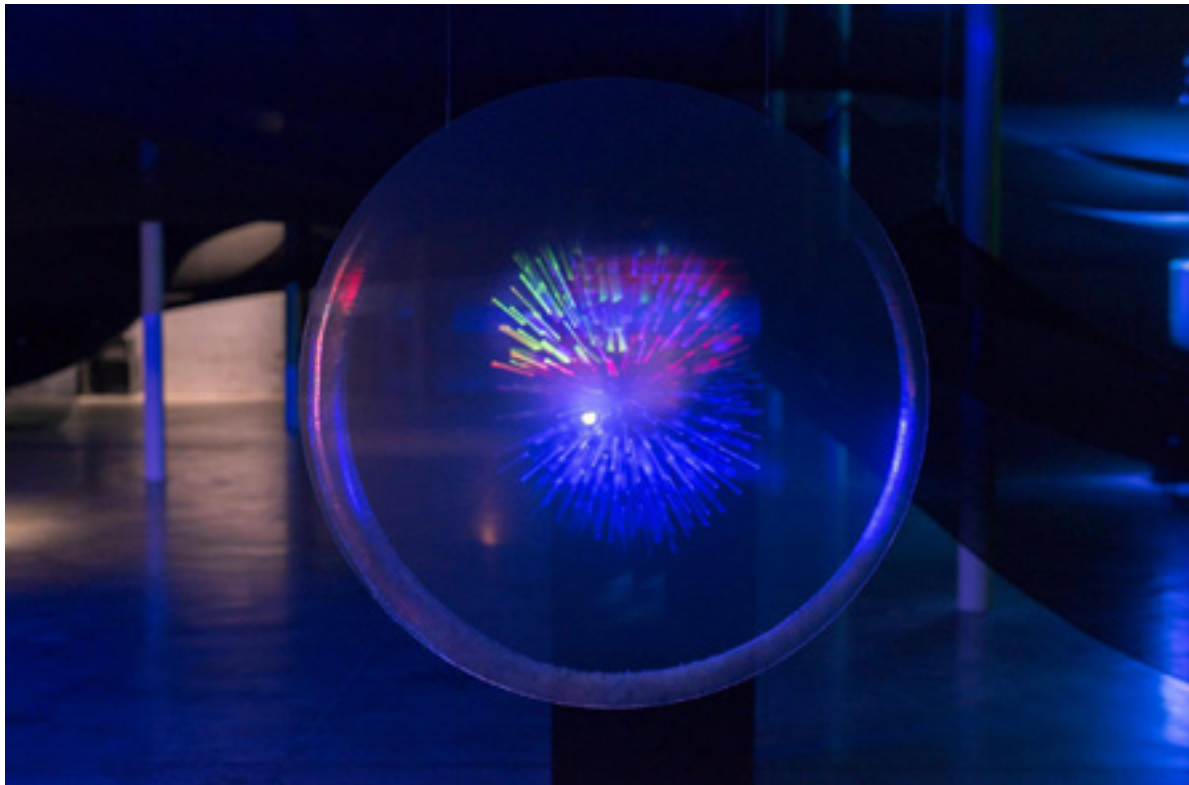
The circular screen showing an enlarged image of the oscillating lycopodium spores (installation at Le Lieu Unique, Nantes, 2016, image Martin Argyroglo for Le Lieu Unique)